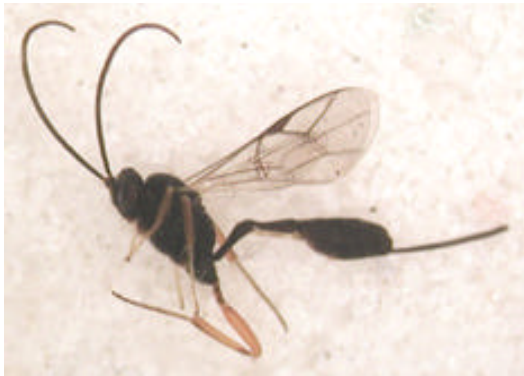
Figure 2. Parasitism of GBM from this parasitic wasp was greater in vineyards receiving selective insecticides.

Targeting late-season GBM pressure: These results from vineyard-scale trials, coupled with our experience in small-plot trials over the past five years indicate that Intrepid has a good fit against late-season GBM pressure. This is a selective insecticide with long-residual activity and good rain-fastness, but it also has a 30 day PHI. Because of this, growers should focus on the optimal timing if considering Intrepid, targeting the late-season increase in GBM pressure, between berry-touch and veraison. Good cluster coverage is essential with this product, so applications should be made to every row with higher gallonage.